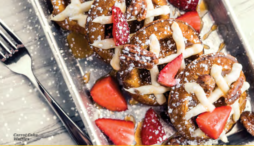
Carrot Cake Waffles