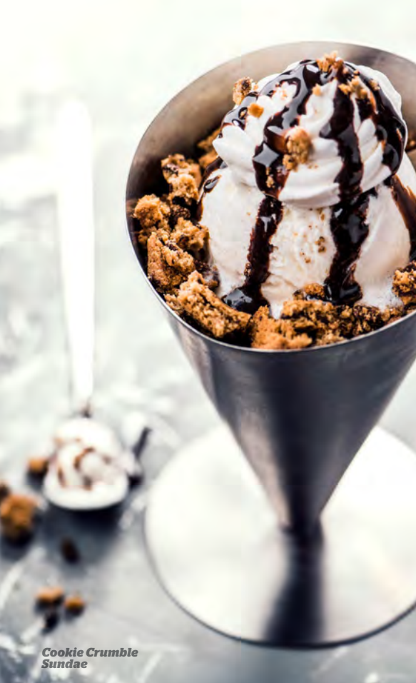
Cookie Crumble Sundae