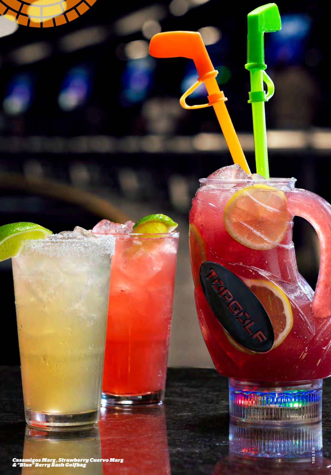
Casamigos Marg, Strawberry Cuervo Marg & "Blue" Berry Bash Golfbag

ADD A FLOAT OF GRAND MARNIER 2 (150 CAL.)