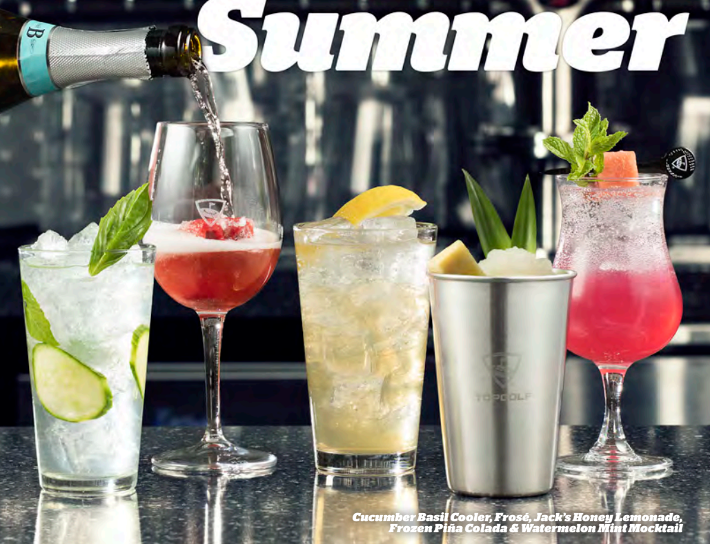
Cucumber Basil Cooler, Frosé, Jack's Honey Lemonade, Frozen Piña Colada & Watermelon Mint Mocktail