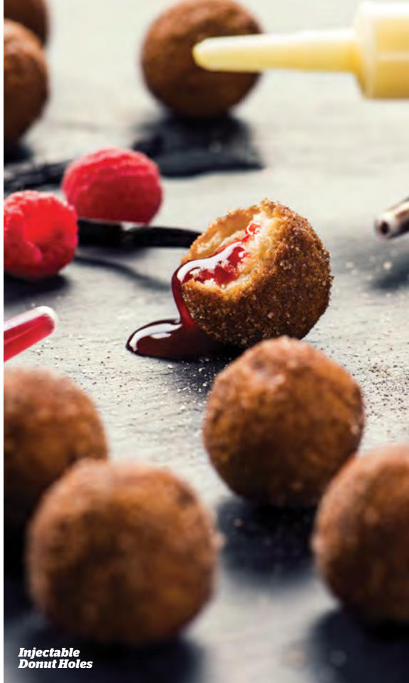
Injectable Donut Holes